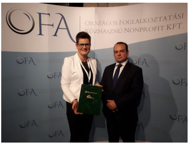
FirstFarms Hungary "Responsible employer of the year"

Fortunately, it was possible to hold several local team-building events for our employees.