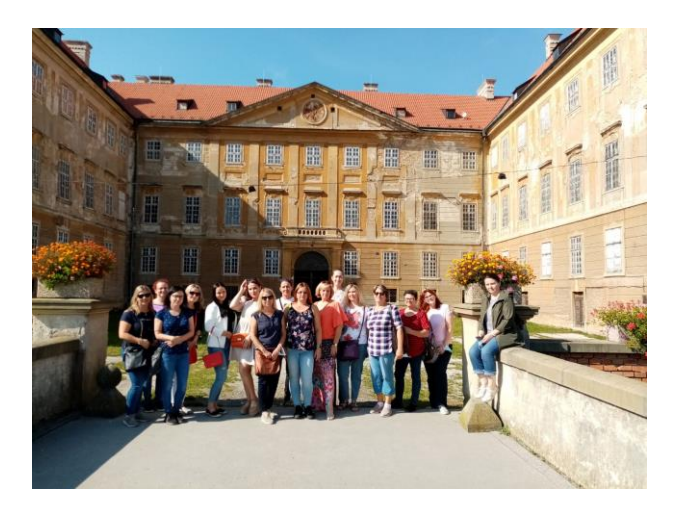
Team building of the administration department of FirstFarms Zahorie (Slovakia)

https://www.firstfarms.dk/fileadmin/Politikker/Diver sity and inclusion policy.pdf