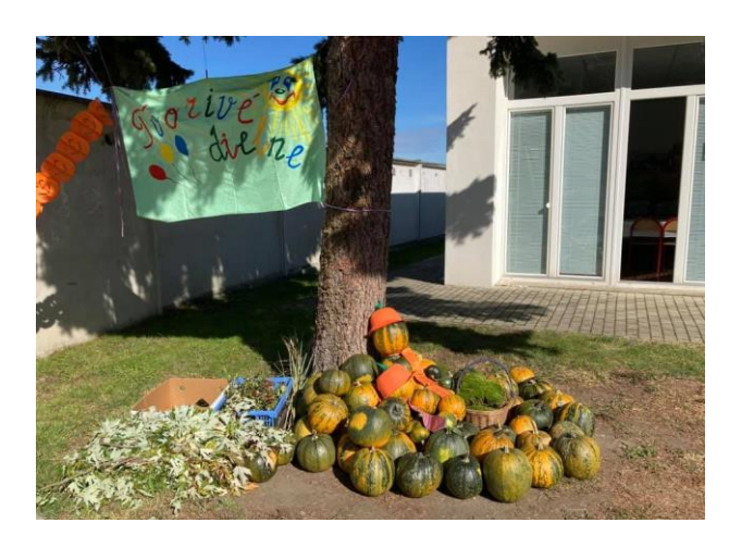
Pumpkins from FirstFarms Zahorie (Slovakia) fields to the local school

FirstFarms Agro East (Romania) also contributed to the cleaning of public roads and collected a significant amount of garbage at our fields.