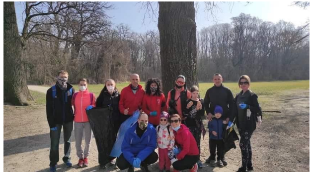
Team FirstFarms Gabcikovo (Slovakia) attending local nature cleaning day