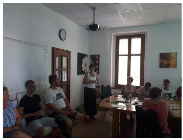
All our employees in FirstFarms Hungary participated in the education about handling dangerous goods