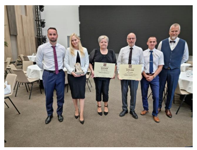
Proud FirstFarms Gabčíkovo team is one of the best managed agro-food companies in Slovakia.

still the main reasons for the high employee circulation among employees in the production. A large part of our employees in the milk production in Slovakia are from Ukraine. Due to the work permit, which is valid for a limited number of years, employees from Ukraine travel back home or should make a new work permit. This factor has a significant influence on FirstFarms' employee circulation. We believe that continuous improvement of working conditions, safety and working environment will improve employees' retention.