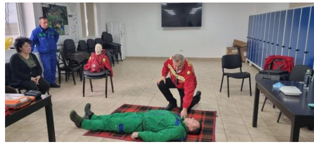
FirstAid training in FirstFarms Agro East (Romania)

In 2022, it is planned to conduct process confirmation of the internal safety organisation, where it has been implemented to identify opportunities for improvement. Moreover, we will implement Internal Safety Representative in the rest of subsidiaries.