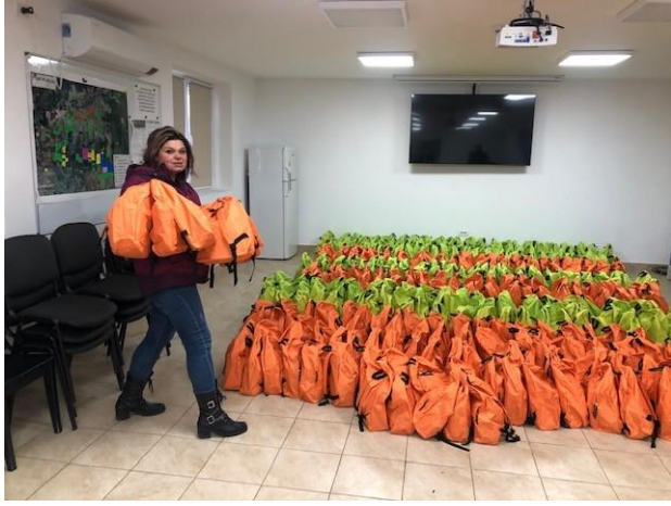
Christmas presents to the local kids from FirstFarms Agro East (Romania)