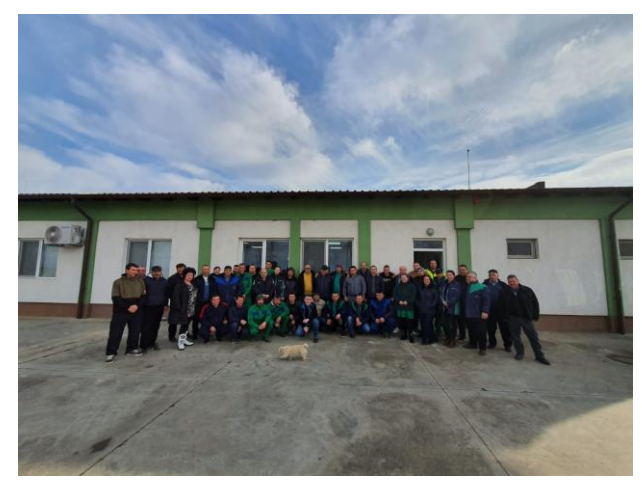
Team FirstFarms Agro East (Romania)