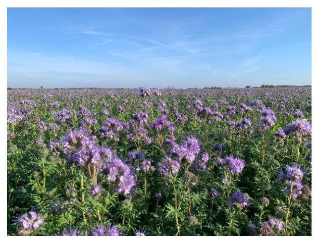
Cover crops on the fields of FirstFarms Zahorie (Slovakia)

FirstFarms operates in different climate zones and cultivates different types of soil. Our soil management is adapted to the types of soil and crops cultivated. An effective part of our soil management is cover crops. Incorporating cover crops in our crop rotation enhances soil fertility and water availability in the soil. Cover crops contribute to the building of reserves of soil nitrogen, that in the long term will reduce the application of nitrogen through fertiliser. Their ability to fix nitrogen from the air into their roots is also beneficial for the climate. FirstFarms strives to increase areas with cover crops each year.